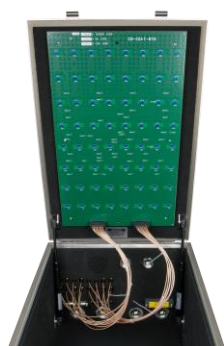
Ixia Antenna Array

The WaveWrap is a custom folding enclosure for optimal over-the-air RF testing of a device. It supports 2x2 using 2 SMA connectors with 4 enclosed antennas.