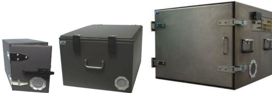
Ixia WaveChambers: Small, Medium, and Large

Designed to provide a simple and space-efficient solution for large-scale testing environments that involve multiple wireless APs, Ixia's WaveChamber provides the isolation, cooling, and filtered signal connectivity needed to achieve accurate and repeatable results. WaveChamber provides an RF-isolated environment small enough to support rack-mounting and desktop use, yet large enough to house most access points in a small, medium and large footprint.