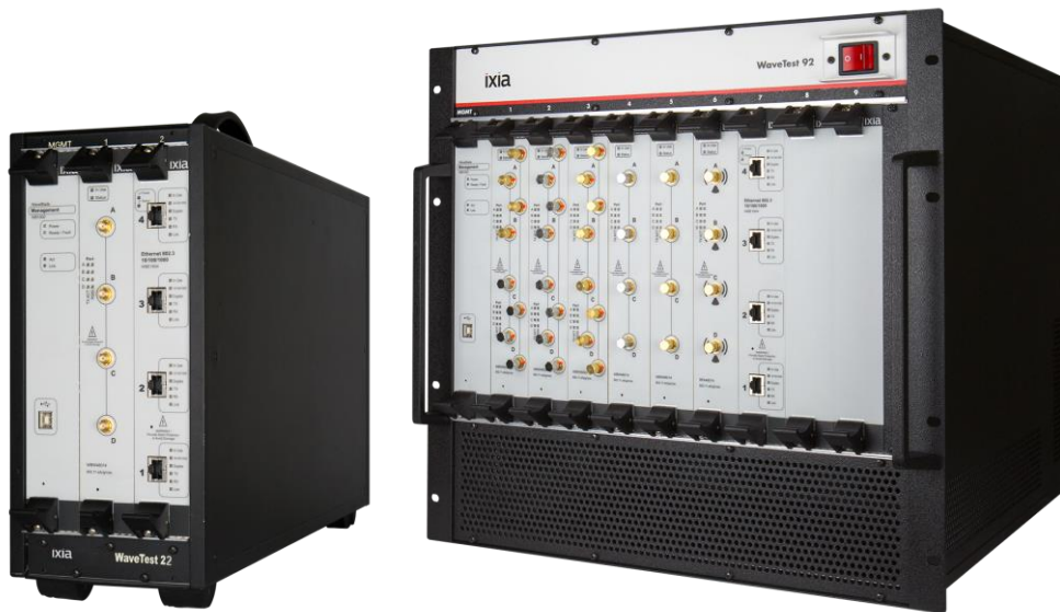
Ixia WT22 and WT92 Chassis